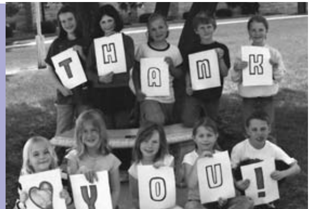
Each year RCH&C gives hospital tours to 175 first graders from around the area.

Right: They also sent a big thank you to RCH&C for the tour.